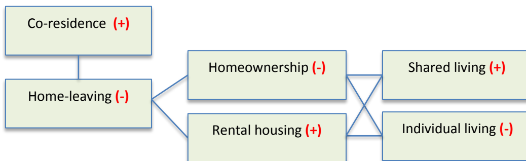
Figure 1: Tenure choice and home-leaving in the crisis period – a conceptual model

Building on current understandings of the course of early housing careers in different country contexts and how they are being reshaped by recent ruptures in socioeconomic conditions, an analysis was carried out that sought to both examine and, to a more limited extent, explain differences between EU 15 countries. Figure One conceptualizes the predicted findings for the empirical analysis. Given that the GFC has affected all Northern and Southern European countries, we expect to find higher co-residence rates in almost all countries in the post-crisis period. Whether this is at the expense of homeownership rates or rental housing is related to country context. However, if the ‘generation rent’ narrative